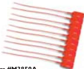
Item #M3859A Secure-pull Seal

Dimensions: 10.6" (270 mm) w X 8" (204 mm) h X 5" (126 mm) d Weight: 19 ounces (.5 kg)