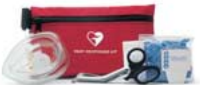
Fast Response Kit Item #68-pchat

The Quick Reference Guide is a brief instruction guide for defibrillator operators. Its short captions and straightforward drawings break down each step of the defibrillation process.