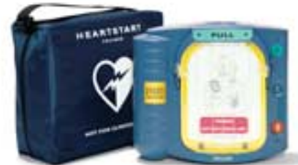
HeartStart Trainer Item #M5085A