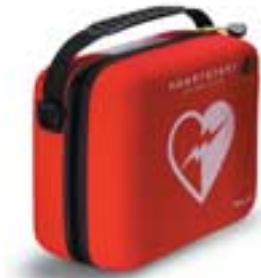
Standard Carry Case Item #M5075A

The Standard and Slim cases are constructed with semi-rigid materials and covered in durable red cordura. A window pocket inside both cases holds the OnSite Quick Reference Guide.