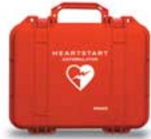
Hard-shell Carry Case Item #YC

Dimensions: 9.5" (24 cm) w X 8.5" (21 cm) h X 3.5" (9 cm) d