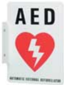
AED Wall Sign Item #M3858A

An AED Wall Sign (M3858A) hanging above a Wall Mount Bracket or Defibrillator Cabinet gives even greater visibility to the defibrillator.