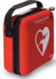
Slim Carry Case Item #M5076A

Dimensions: 9.5" (24 cm) w X 8.5" (21 cm) h X 4.8" (12 cm) d