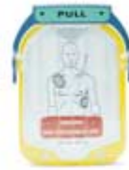
Adult Training Pads Cartridge Item #M5073A

The training toolkit (M5066-89100) includes instructional aids, such as a videotape and CD with a PowerPoint presentation, for teaching groups of people to operate the HeartStart OnSite Defibrillator and the HeartStart FR2+ Defibrillator.