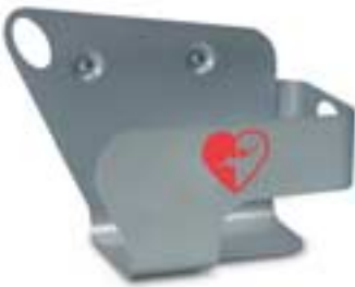
Wall Mount Bracket Item #M3857A

The Wall Mount Bracket (M3857A) is designed specifically for housing a Philips HeartStart Defibrillator and its accessories. HeartStart OnSite's carry case can be tethered to the Wall Mount bracket with a breakaway Secure-Pull Seal (M3859A), to discourage tampering. A broken seal indicates that the defibrillator has been removed from the Wall Mount and accessories may need to be replenished.