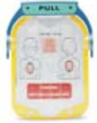
Infant/Child Training Pads Cartridge Item #M5074A