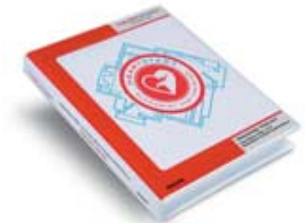
Instructor's Training Toolkit Item #M5066-89100